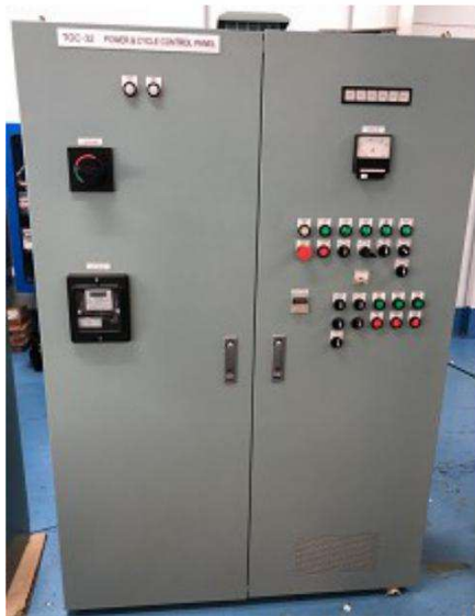
Control panel for Heat treatment factory