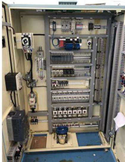
Inside of Control Panel