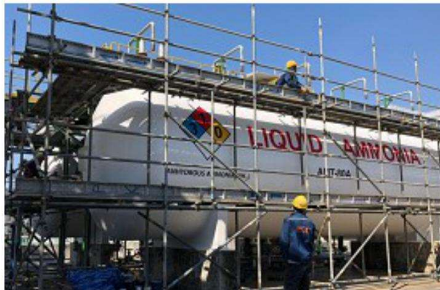
Thermal Barrier Coating