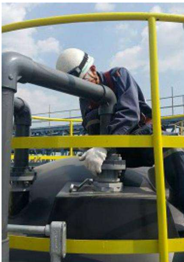
Change piping of Tank 1