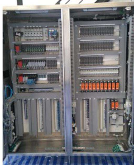
Inside of Control Panel