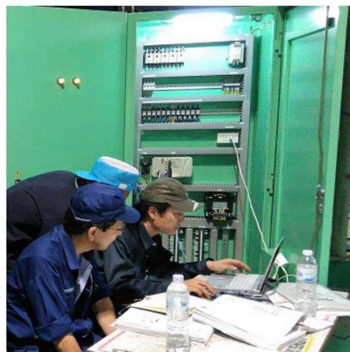
PLC & HMI Programing