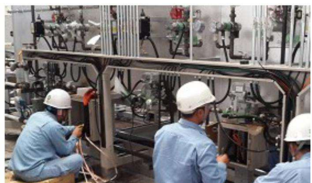
Electrical Wiring Work 2