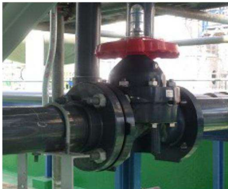
Change piping of Tank 2