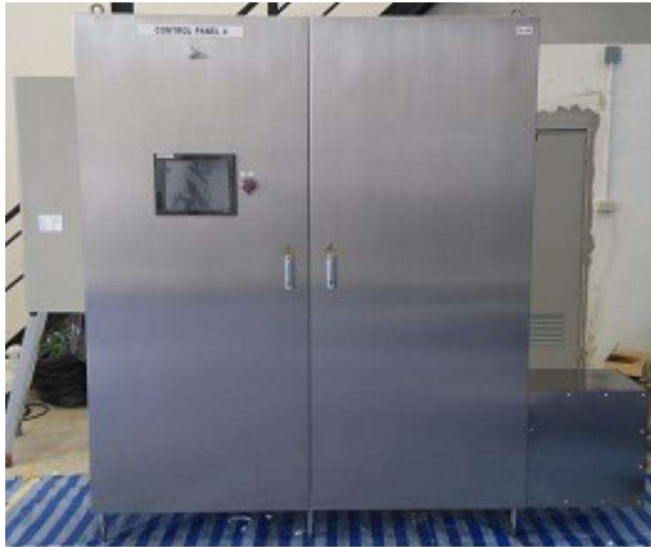
Control Panel made by SUS for Drink Maker