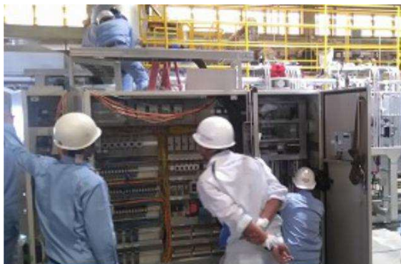
Electrical Wiring Work 1