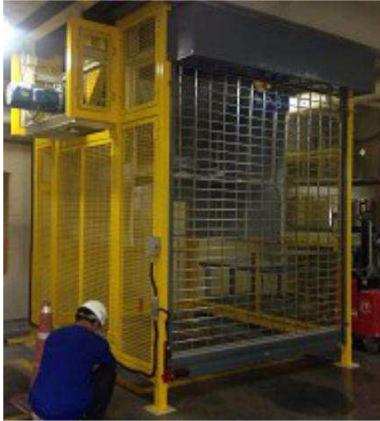
Safety Guards Setting